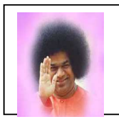
(Sri Sathya Sai Baba)

And whoever welcomes in my name a child such as this, welcomes me.