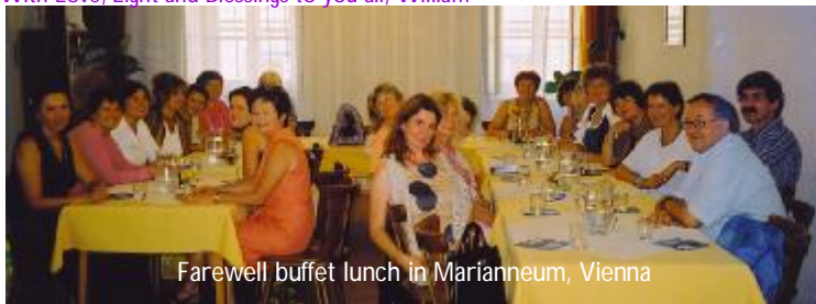
Farewell buffet lunch in Marianneum, Vienna