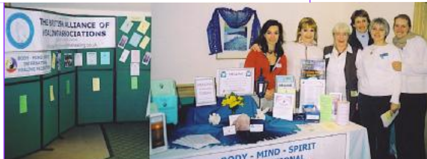
BMS-IHF at the Good Health Show Live in Brighton, 20 th to 21 st November 2004. Many thanks to the 18 members who gave up their time to support our stand and do what they do best – healing!

BMSI-IHF Data Protection Regn. No. PZ656262X